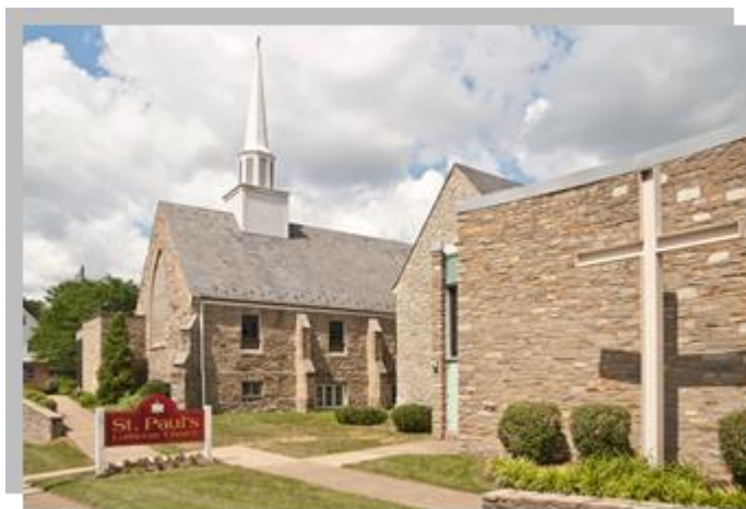
St. Paul's Lutheran Church 120 N. Easton Road Glenside PA 19038